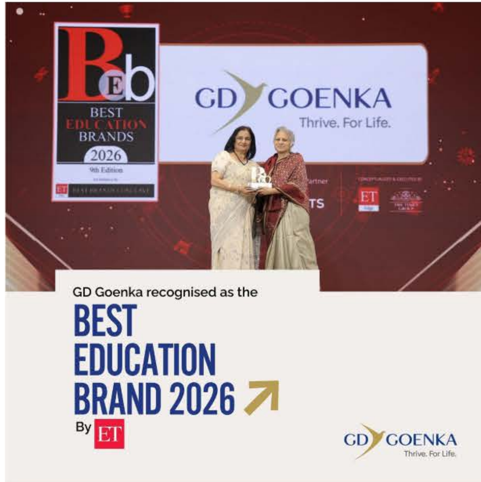
GD Goenka Recognised as 'Best Education Brand 2026' by ET Edge